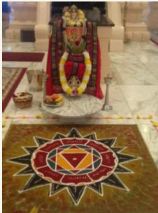
Rathasapthami event at SVBF temple

This festival falls on the seventh day of the bright half of the month of Magha. It is celebrated as Surya Jayanti or Surya's birthday. This is also regarded as the day when the sun's chariot turns northward. This chariot is said to be drawn by seven white horses. The seven horses and the seventh day of the month are perhaps a reference to the seven colors of the rainbow and the seven suns – Aroga, Bhraja, Pathara, Patanga, Svarnara, Jyotisiman and Vibhasa . In Hindu numerology, seven is a significant number as there are seven Rishis, seven oceans, seven islands, seven books of the Ramayana etc. RathaSaptami is dedicated to Surya Bhagavan, and the Lord is worshipped for good health and wellbeing. This day is marked by the recitation of Aruna Prashnam with Namaskarams at the end of each anuvakam (section.) The temple conducted a special puja with the chanting of Aruna Prashnam, Navagraha and Naksatra Suktams .